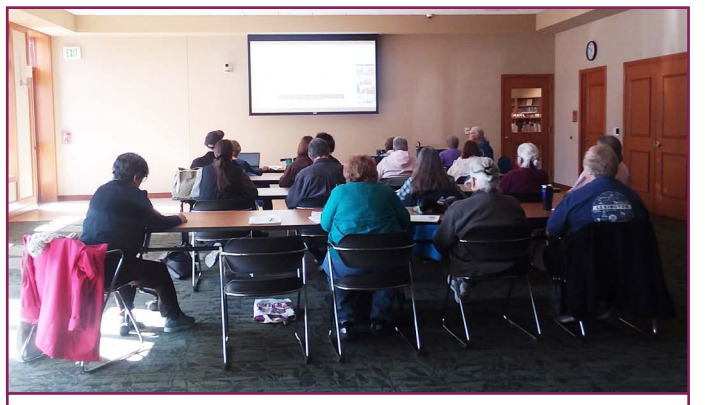
At the April 2025 PPDL Internet Users Group meeting over twenty attendees (in person and via Zoom) learned general Microsoft Windows tips and tricks as well as the implications of sunsetting (later this year) of support for the Microsoft Windows 10 operating system.