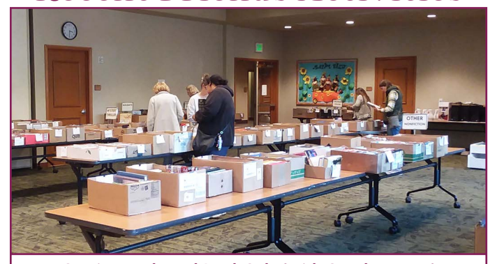
Semiannual Used Book Sale (Mid-October 2024)