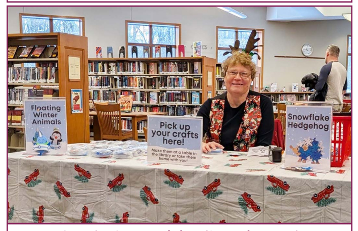
Santa's Winter Workshop (December 2024)