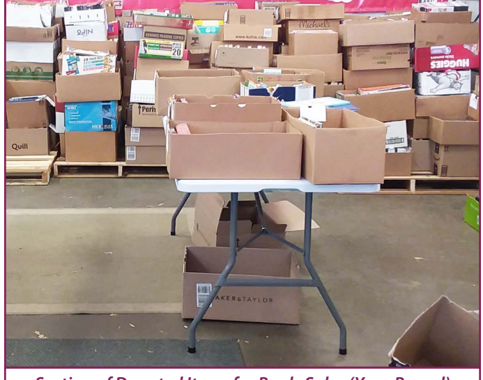
Sorting of Donated Items for Book Sales (Year-Round)