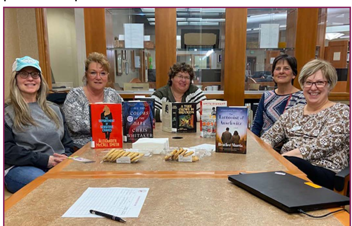
Participants shared snacks and insights about their chosen books at the March 2025 Friends Read book club meeting.

The first four meetings this year have been fun as we shared books that we enjoyed (or didn't) and why. So far we have discussed a wide variety of genres including science fiction, murder mysteries, various nonfiction topics and everything in between. After the meeting, all participants are sent a list of the books discussed that evening, along with a brief plot description.