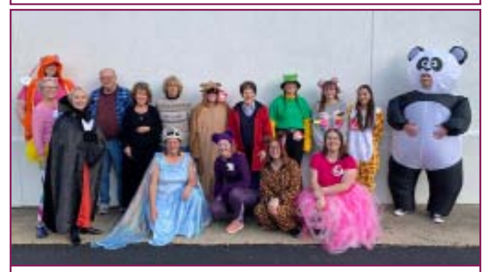
Spooktacular Event @Tapper Chevy (Late-October 2024)